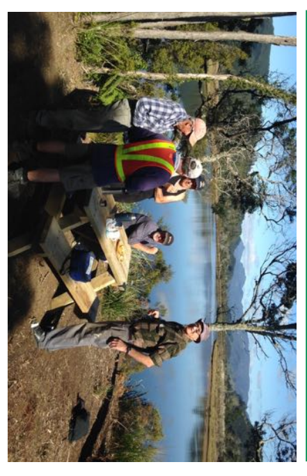
Native flora and fauna has flourished with the removal of wattle and weeds and the trapping of hundreds of possums, rats and stoats. We need you to help by sponsoring a trap.