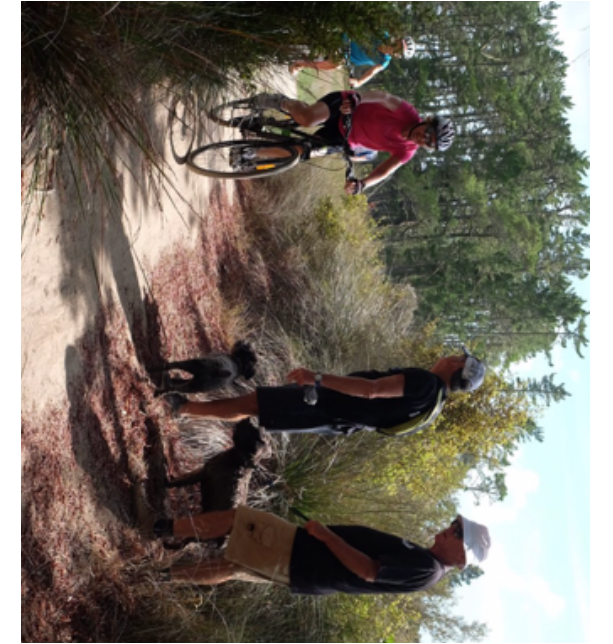
PLEASE MAKE SURE YOUR DOGS ARE KEPT ON LEADS AND REMAIN ON THE TRAIL AT ALL TIMES